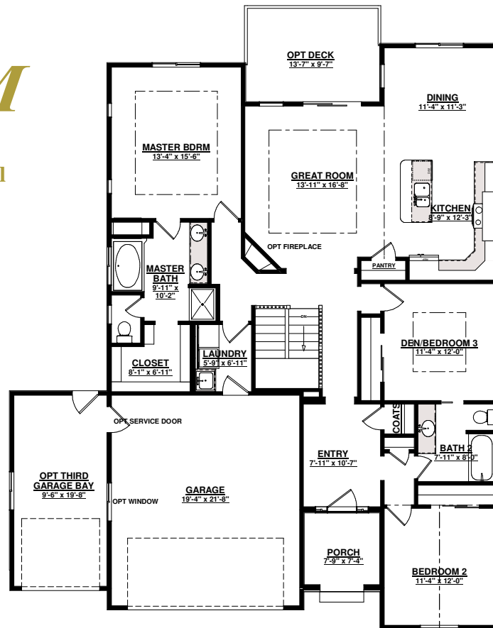
MAIN LEVEL FLOOR PLAN 1711 sq ft