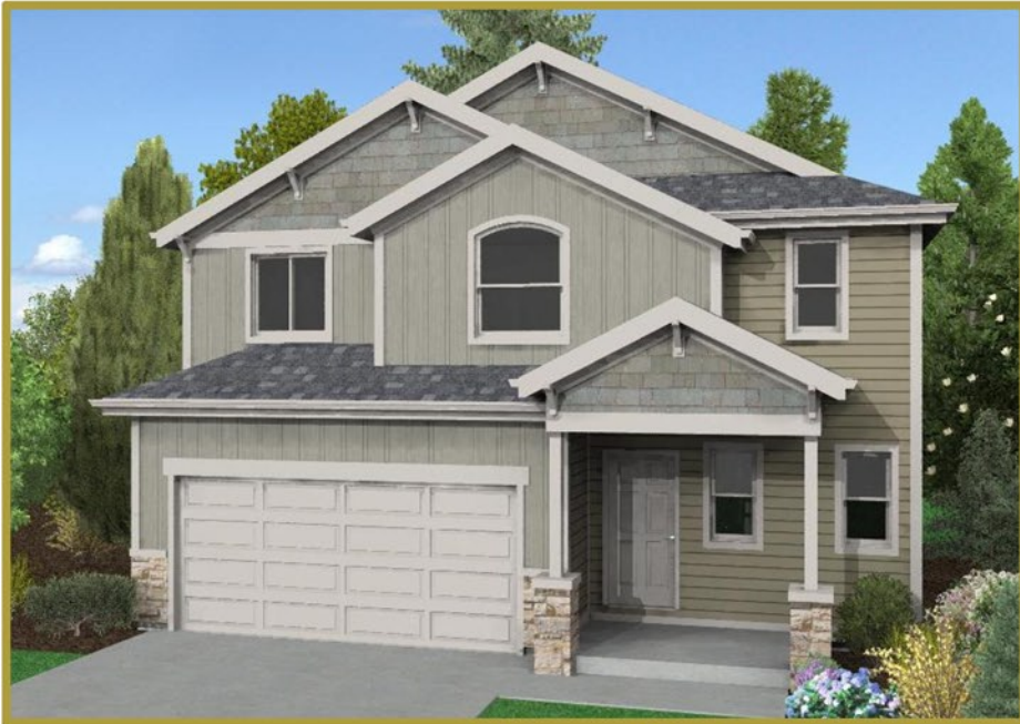
Shown with Optional Stone Veneer