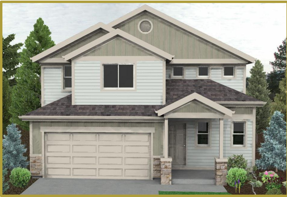
Shown with Optional Stone Veneer