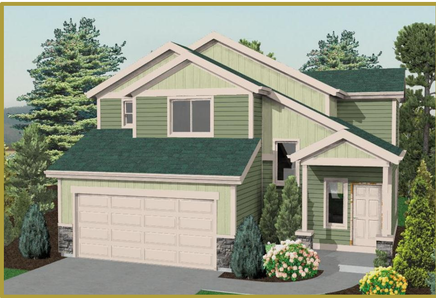
Shown with Optional Stone Veneer